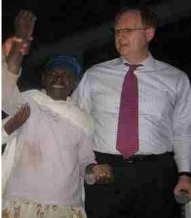
This woman came totally blind and left seeing