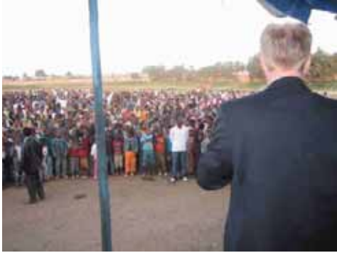
Evangelism on the soccer field

As long as the door is open in Ethiopia I will go there and preach the gospel. They told me they could prepare a crusade every 6 weeks if I had the funds.