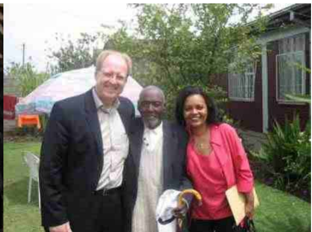
Here is his wife and the oldest man in her home for elderly people, 104 years of age

I want to thank you one again very, very much for your prayers and your support, to make this journey possible. I believe that the money will bear fruit in eternity and that it was a good investment into the kingdom of God.